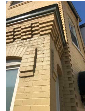
Existing holes for hanging sign.