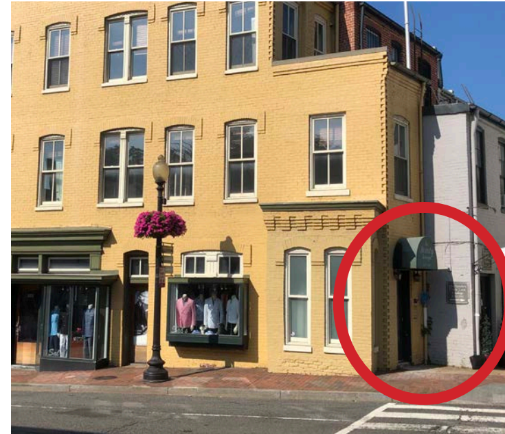
North side of building (facing Wisconsin Ave).