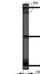
SECTION A-A II SCALE 1:5

Threaded Stud Boss Size varies by bracket