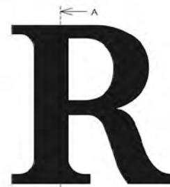
FRONT VIEW II SCALE 1:5

"L" bracket secured with high resistance epoxy to return