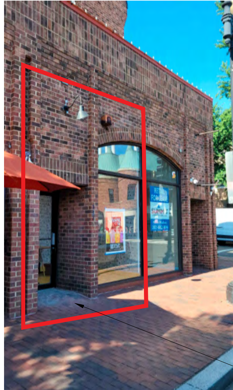
2 EXTERIOR STORE FRONT SCALE: NTS