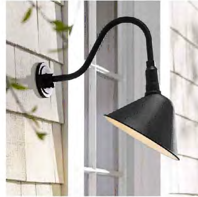
GOOSE NECK EXTERIOR SIGN LIGHT