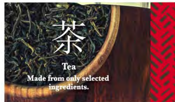
PROPOSED WINDOW STICKER