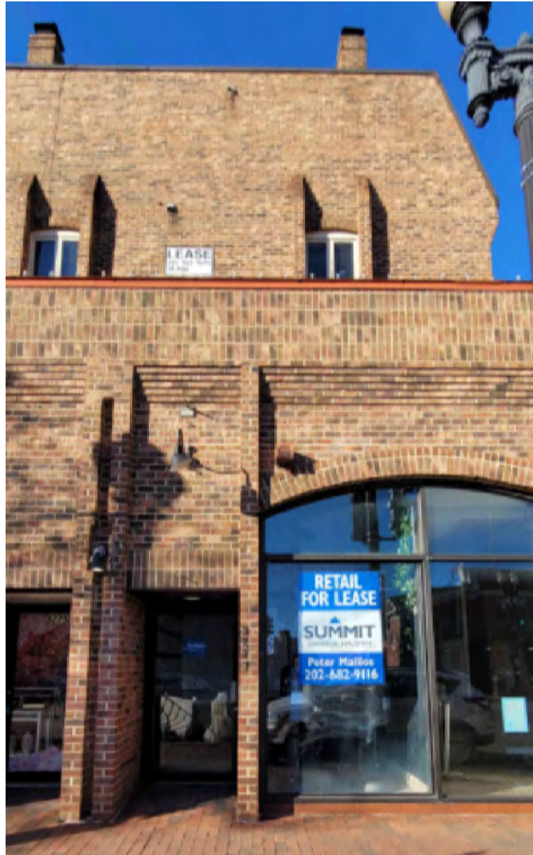
1 EXTERIOR STORE FRONT SCALE: NTS